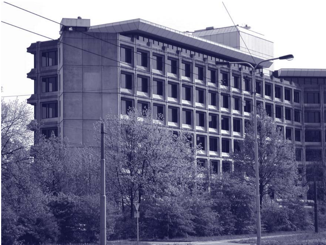
Tax office in Arnhem, the Netherlands where a LowEx system is being planned.

This building, owned by the government, is approximately 30 years old and will be renovated. The Dutch Ministry of Housing, Spatial Planning and the Environment has committed itself to realising energy savings in as many government-owned buildings as possible. Also for the renovation of this building, energy saving and sustainable building were important basic principles.