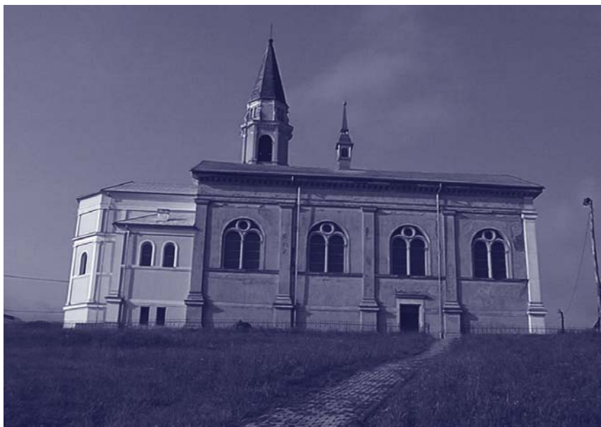
The Parish church, St. Martin in Teharje, Slovenia.