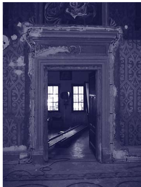
"Temperisation" heating system. Copper pipes built in the wall around the door.

Most of the buildings, representing cultural heritage are not equipped with technology for temperature or humidity conditioning, according to modern standards. Churches, with its high space, big mass of the walls and intermittent use represent a special case regarding heating system.